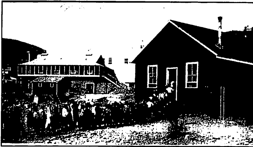
East Side of Oatman Drug Company Building, 1916

A historic photograph of the Oatman Drug Company Building taken in 1916 indicates that the balcony porch had a very similar appearance to its modern appearance. However, a historic photograph of the building dated ca. 1917-1918 shows the balcony screened. This picture also indicates that there were originally two four-over-four paned windows on the front façade. The east window has since been replaced by a wood door. A third photograph dating 1933 reveals that by this date, the screening on the balcony had been removed and wood railing installed.