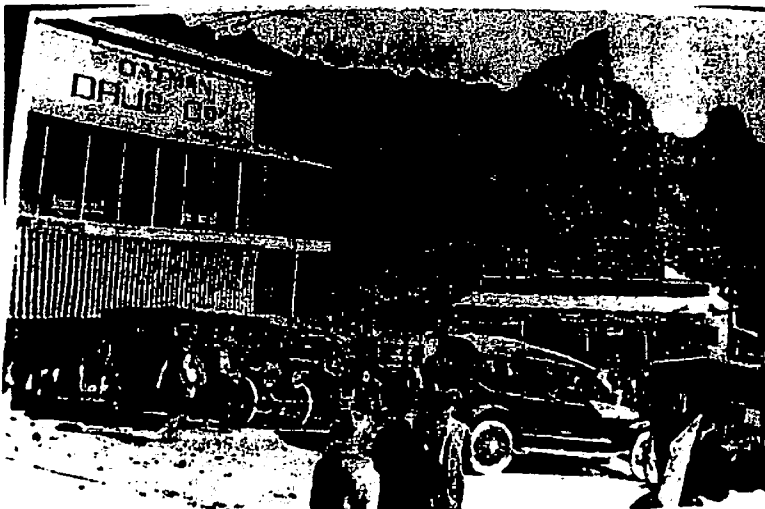
Oatman Drug Company Building, ca. 1917-1918

The only recorded modification to the interior involved the 1916 installation of a concrete vault on the ground floor in 1916 when the building housed the Arizona Central Bank. More recently (within the last two decades) the Main Street facade of the lower story, including the front porch posts, has been painted.